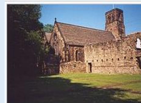
St Paul's Church, Jarrow

His most famous work, which is a key source for the understanding of early British History was called 'Historia Ecclesiastica History of the English People' - This was completed in 741 AD and is the first work of history in which the AD system of dating is used.