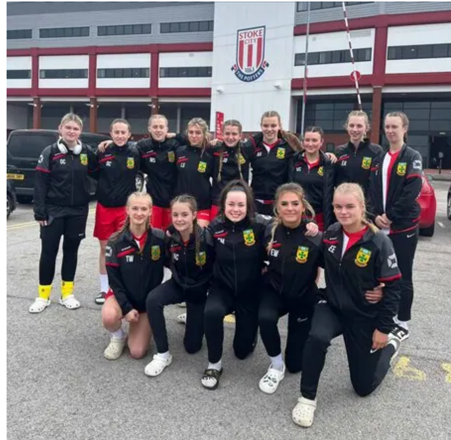
Our 23/24 U16 girls team won the English School's Football Association National Final.